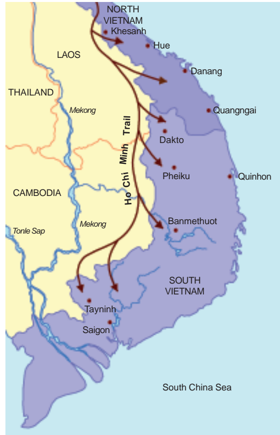
Fig. 14 – The Ho Chi Minh trail. Notice how the trail moved through Laos and Cambodia.

Most of the trail was outside Vietnam in neighbouring Laos and Cambodia with branch lines extending into South Vietnam. The US regularly bombed this trail trying to disrupt supplies, but efforts to destroy this important supply line by intensive bombing failed because they were rebuilt very quickly.