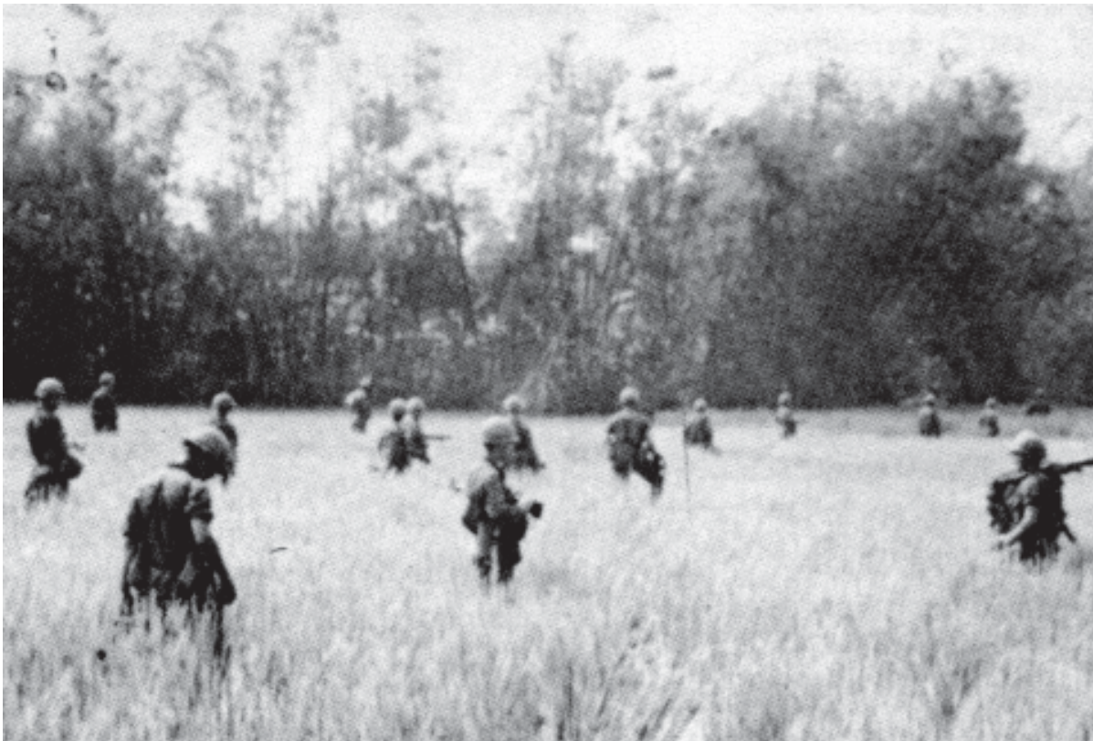
Fig. 12 – American soldiers searching rice fields for Vietcongs.

US entry into the war marked a new phase that proved costly to the Vietnamese as well as to the Americans. From 1965 to 1972, over 3,403,100 US services personnel served in Vietnam (7,484 were women). Even though the US had advanced technology and good