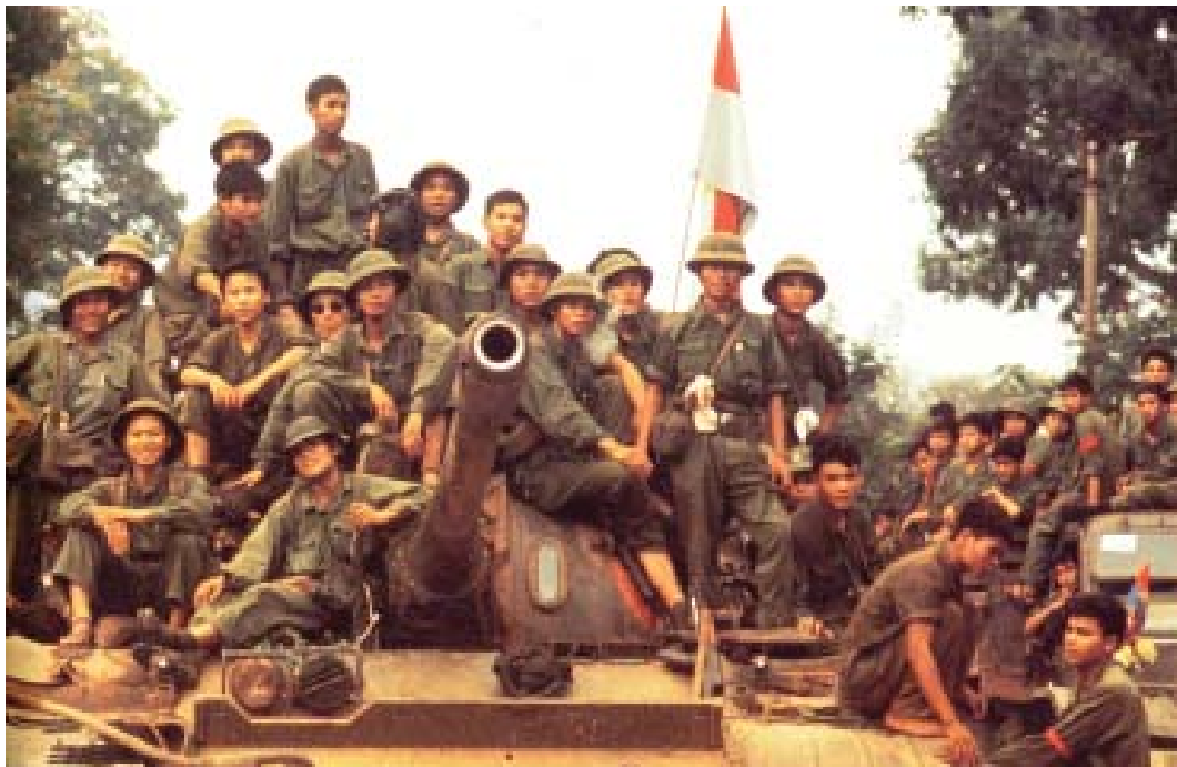
Fig. 21 – Vietcong soldiers pose triumphantly atop a tank after Saigon is liberated. What does this image tell us about the nature of Vietnamese nationalism?