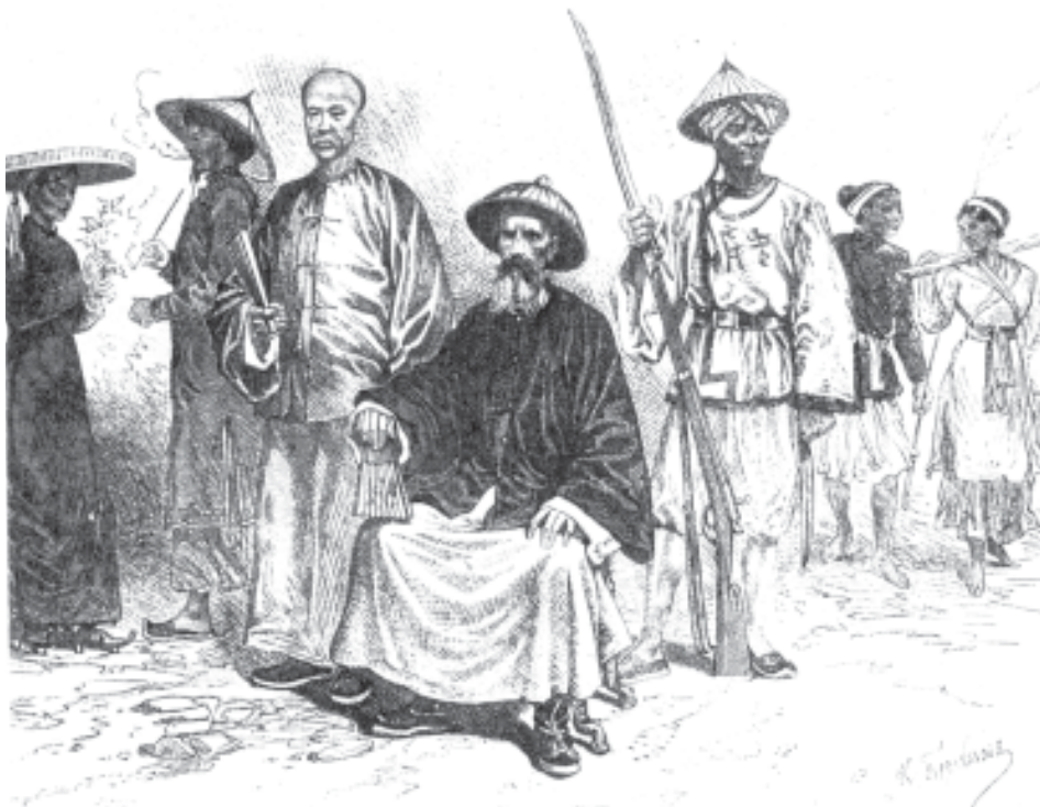
Fig. 5 – A French weapons merchant, Jean Dupuis, in Vietnam in the late nineteenth century. Many like him explored the regions in the hope of making profits from trade. He was one of those who persuaded the French to try and establish a base in Vietnam.

Indentured labour – A form of labour widely used in the plantations from the mid-nineteenth century. Labourers worked on the basis of contracts that did not specify any rights of labourers but gave immense power to employers. Employers could bring criminal charges against labourers and punish and jail them for non-fulfilment of contracts.