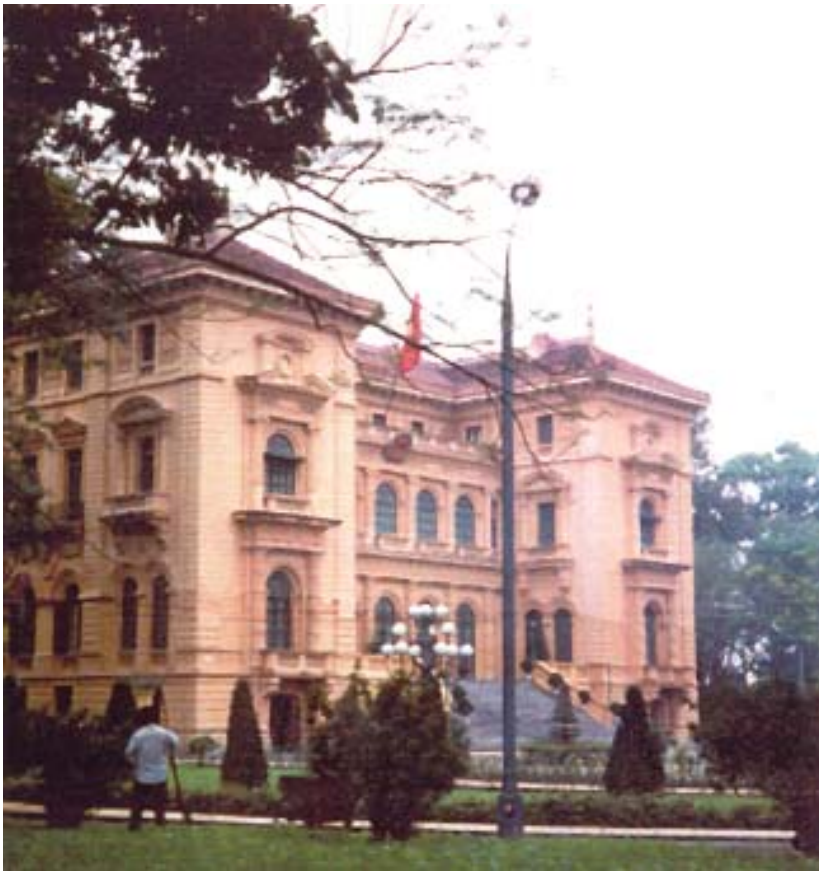
Fig. 7 – Modern Hanoi. Colonial buildings like this one came up in the French part of Hanoi.

The French part of Hanoi was built as a beautiful and clean city with wide avenues and a well-laid-out sewer system, while the ‘native