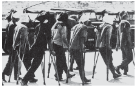
Fig. 20 – North Vietnamese prisoners in South Vietnam being released after the accord .

The widespread questioning of government policy strengthened moves to negotiate an end to the war. A peace settlement was signed in Paris in January 1974. This ended conflict with the US but fighting between the Saigon regime and the NLF continued. The NLF occupied the presidential palace in Saigon on 30 April 1975 and unified Vietnam.