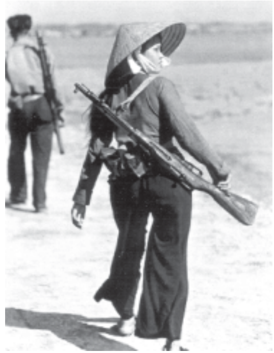
Fig. 18 – With a gun in one hand.

By the 1970s, as peace talks began to get under way and the end of the war seemed near, women were no longer represented as warriors. Now the image of women as workers begins to predominate. They are shown working in agricultural cooperatives, factories and production units, rather than as fighters.