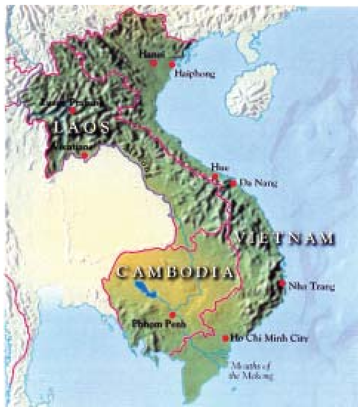
Fig. 1 – Map of Indo-China.

If you see the historical experience of Indo-China in relation to that of India, you will discover important differences in the way colonial empires functioned and the anti-imperial movement developed. By looking at such differences and similarities you can understand the variety of ways in which nationalism has developed and shaped the contemporary world.