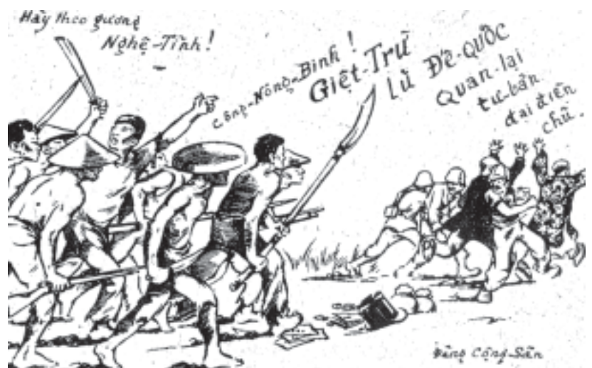
Fig. 9 – Cartoon of Vietnamese nationalists chasing away imperialists. In all such nationalist representations of struggle the nationalists appear heroic, marching ahead, while the imperial forces flee.

Soon, however, the anti-imperialist movement in Vietnam came under a new type of leadership.