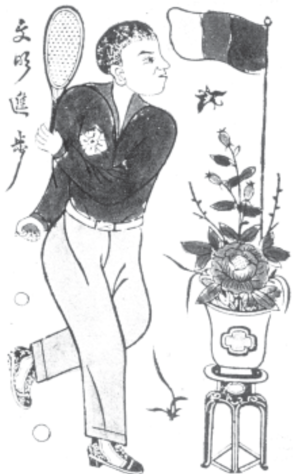
Fig. 6 – A local caricature ridiculing the Vietnamese who has been westernised. Abandoning his own culture, he has begun wearing Western clothes and playing tennis.