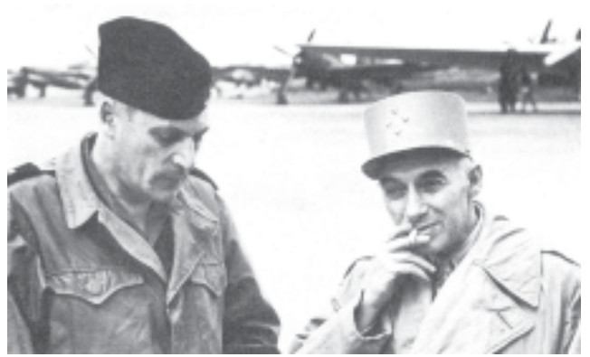
Fig. 10 – The French Commander in Indo-China, General Henri Navarre (right). Navarre wanted to attack the Vietminh even in their remote bases. As a consequence the French opened many fronts of attack and scattered their forces. Navarre's plans backfired in the North Eastern Valley of Dien Bien Phu.

With the help of the Ho Chi Minh government in the north, the NLF fought for the unification of the country. The US