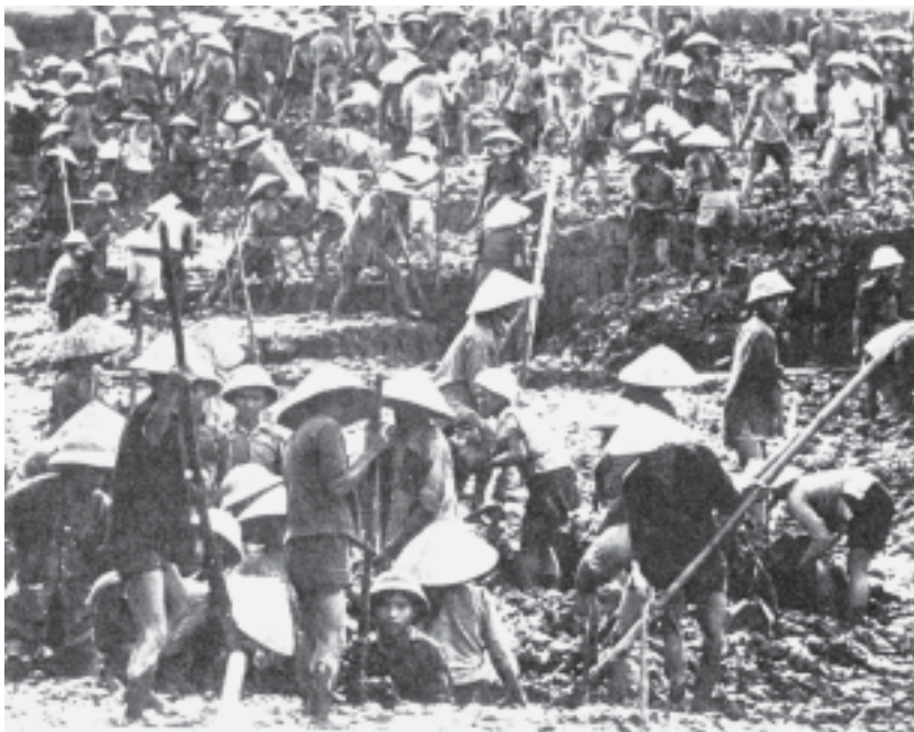
Fig. 15 – Rebuilding damaged roads. Roads damaged by bombs were quickly rebuilt.