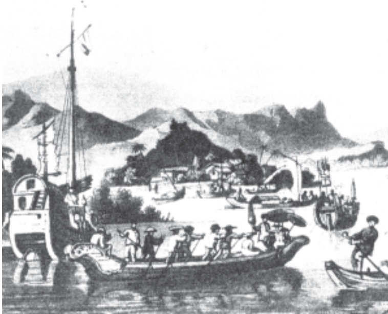
Fig. 2 – The port of Faifo. This port was founded by Portuguese merchants. It was one of the ports used by European trading companies much before the nineteenth century.

Vietnam was also linked to what has been called the maritime silk route that brought in goods, people and ideas. Other networks of trade connected it to the hinterlands where non-Vietnamese people such as the Khmer Cambodians lived.