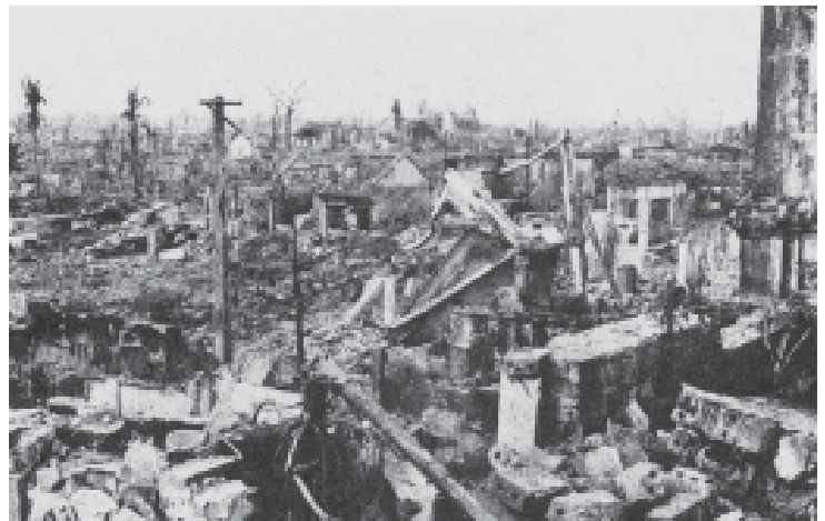
Fig. 13 – In December 1972 Hanoi was bombed.

The tonnage of bombs, including chemical arms, used during the US intervention (mostly against civilian targets) in Vietnam exceeds that used throughout the Second World War.