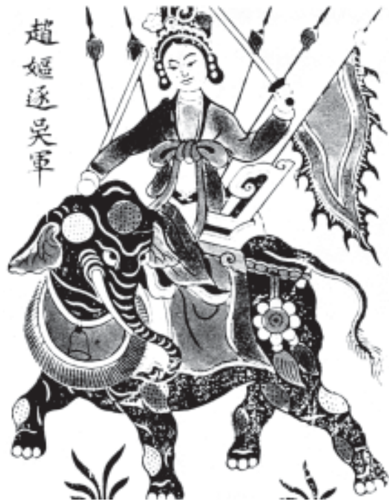
Fig. 17 – Image of Trieu Au worshipped as a sacred figure. Rebels who resisted Chinese rule continue to be celebrated.

Other women rebels of the past were part of the popular nationalist lore. One of the most venerated was Trieu Au who lived in the third century CE. Orphaned in childhood, she lived with her brother. On growing up she left home, went into the jungles, organised a large army and resisted Chinese rule. Finally, when her army was