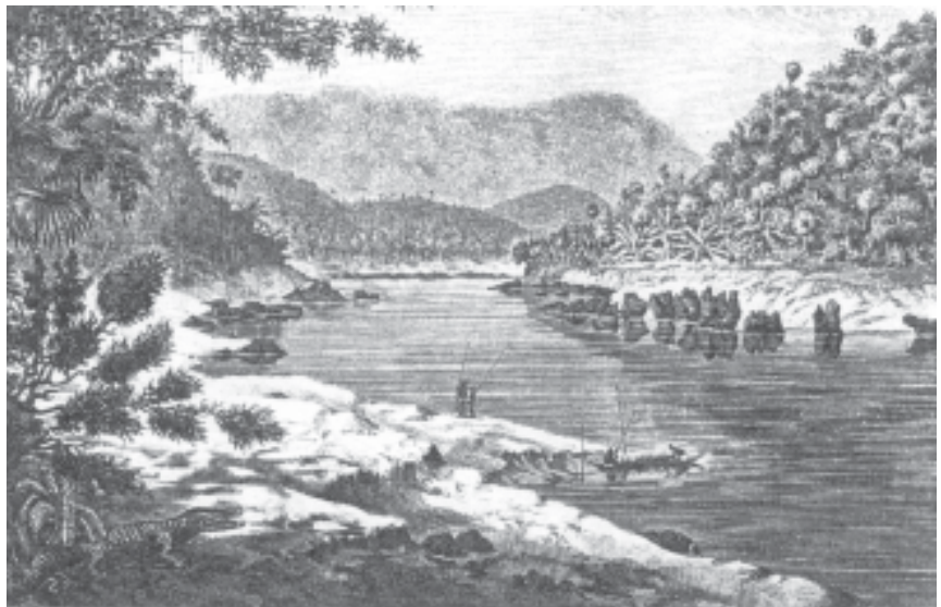
Fig. 4 – The Mekong river, engraving by the French Exploratory Force, in which Garnier participated. Exploring and mapping rivers was part of the colonial enterprise everywhere in the world. Colonisers wanted to know the route of the rivers, their origin, and the terrain they passed through. The rivers could then be properly used for trade and transport. During these explorations innumerable pictures and maps were produced.

French troops landed in Vietnam in 1858 and by the mid-1880s they had established a firm grip over the northern region. After the Franco-Chinese war the French assumed control of Tonkin and Anaam and, in 1887, French Indo-China was formed. In the following decades the French sought to consolidate their position, and people in Vietnam began reflecting on the nature of the loss that Vietnam was suffering. Nationalist resistance developed out of this reflection.