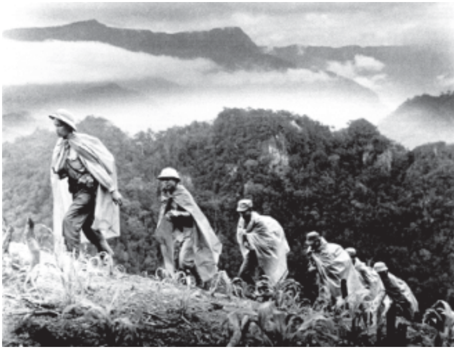
Fig.16 – On the Ho Chi Minh trail.