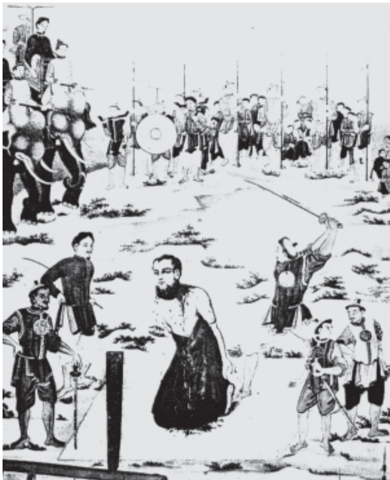
Fig. 8 – The execution of Father Borie, a Catholic missionary. Images like this by French artists were publicised in France to stir up religious fury.

Confucius (551-479 BCE), a Chinese thinker, developed a philosophical system based on good conduct, practical wisdom and proper social relationships. People were taught to respect their parents and submit to elders. They were told that the relationship between the ruler and the people was the same as that between children and parents.