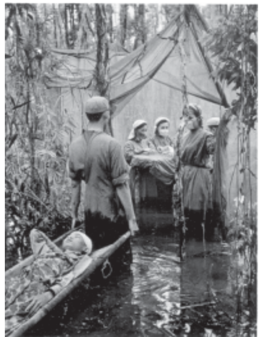
Fig. 19 – Vietnamese women doctors nursing the wounded.

Stories about women showed them eager to join the army. A common description was: 'A rosy-cheeked woman, here I am fighting side by side with you men. The prison is my school, the sword is my child, the gun is my husband.'