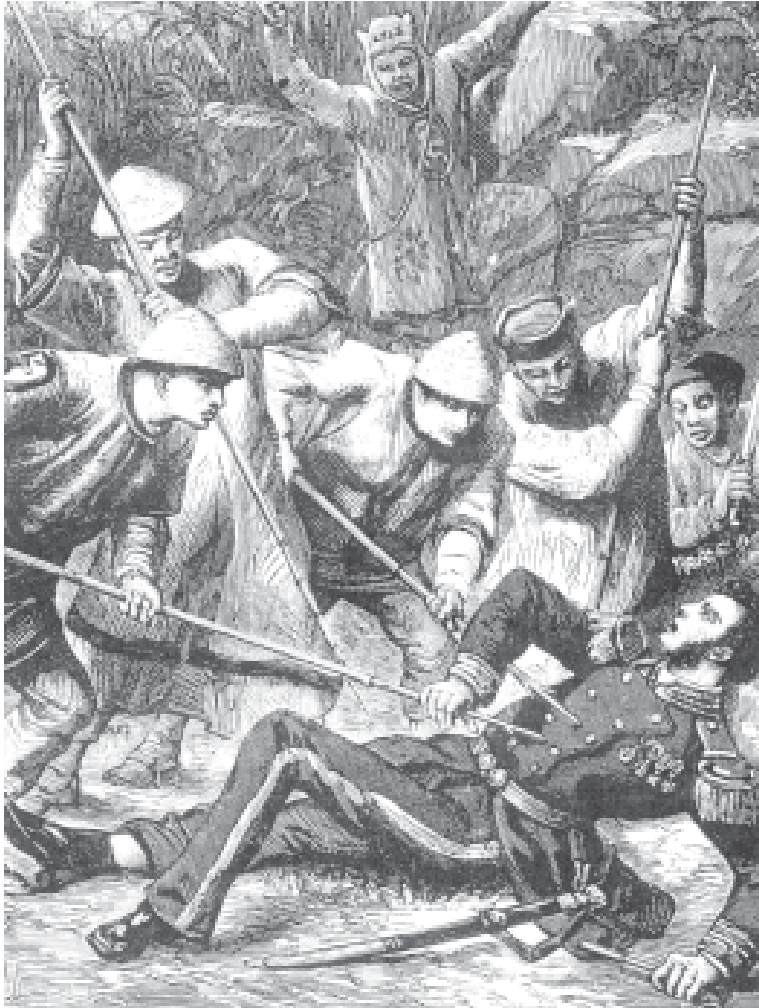
Fig. 3 – Francis Garnier, a French officer who led an attack against the ruling Nguyen dynasty, being killed by soldiers of the court. Garnier was part of the French team that explored the Mekong river. In 1873 he was commissioned by the French to try and establish a French colony in Tonkin in the north. Garnier carried out an attack on Hanoi, the capital of Tonkin, but was killed in the fight.

French troops landed in Vietnam in 1858 and by the mid-1880s they had established a firm grip over the northern region. After the Franco-Chinese war the French assumed control of Tonkin and Anaam and, in 1887, French Indo-China was formed. In the following decades the French sought to consolidate their position, and people in Vietnam began reflecting on the nature of the loss that Vietnam was suffering. Nationalist resistance developed out of this reflection.